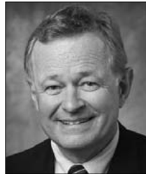
Stein Sture Interim Provost